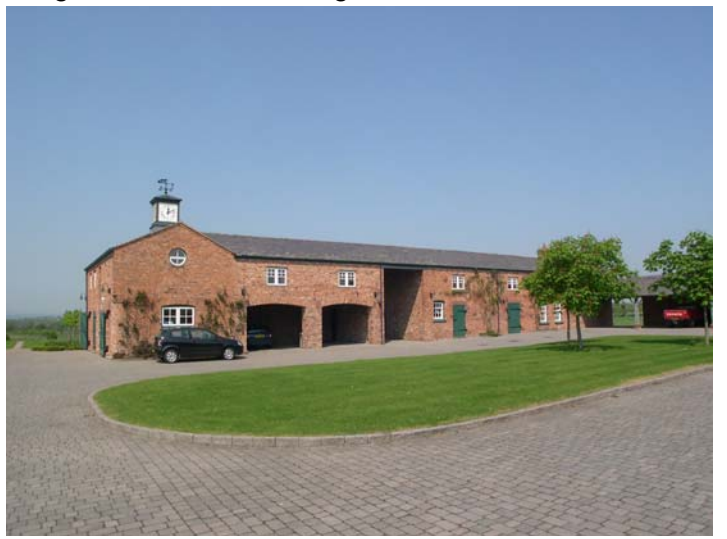
Stretton Hall Farm dependancies

Boundary treatments have a significant impact upon the setting of properties, the coherence of a group and the overall character of a