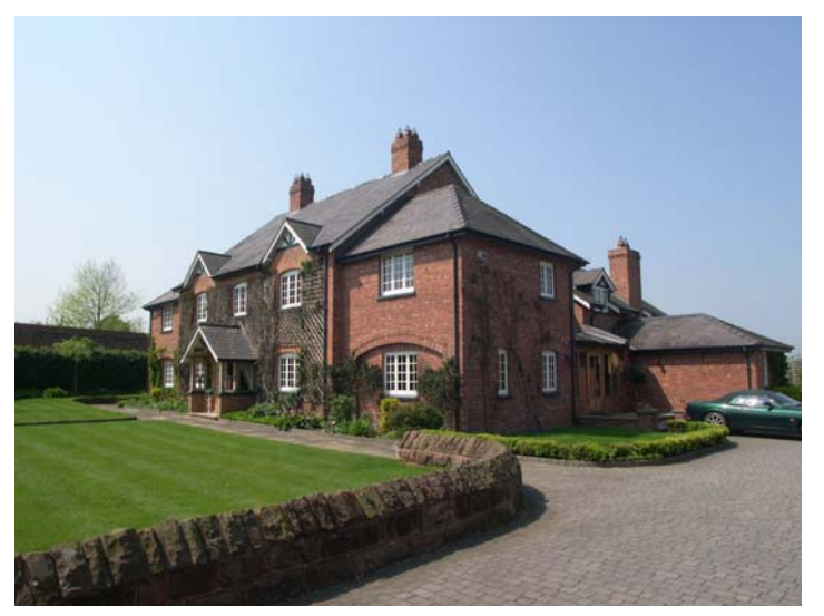
Stretton Hall Farm

The listed elements within the conservation area highlight the key features of its overall character. These include two types of building construction: the timber framed