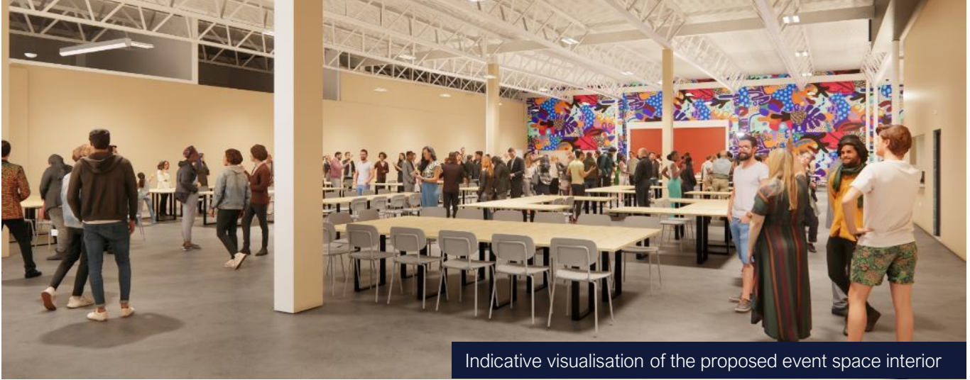
Indicative visualisation of the proposed event space interior